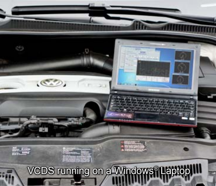
VCDS running on a Windows® Laptop

Communicating through a WiFi connection (802.11B/G) via web browser, or the standard VCDS program on a Windows PC, this interface frees the user from needing a particular hardware platform. No longer will technicians have to wait for the shop PC to be available. They can simply pull out their smart phones, connect to the HEX-NET device, and read the fault codes in the vehicle.